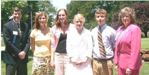
Past Scholarship Recipients